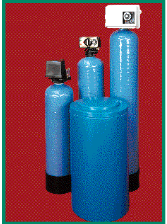
Autorol 255, Fleck 5600 and 2750 Valves illustrated.

They work by a process known as ion exchange. The hard water passes through a high quality exchange resin column inside a pressure vessel. The resin removes the calcium and magnesium ions from the solution and exchanges them for sodium ions. When the resin is about to become exhausted the softener commences the regeneration phase which is initiated by timer or volume control. The actual regeneration is achieved when the softener draws a solution of common salt - called brine - through the column of resin which displaces the captured calcium and magnesium ions and replaces them with the sodium ions in the brine. Throughout the regeneration period the unwanted ions and all the subsequent rinsing is flushed to drain and does not enter the service line. The regeneration period takes between 60 and 120 minutes depending upon the size of the softener and it can be repeated as often as